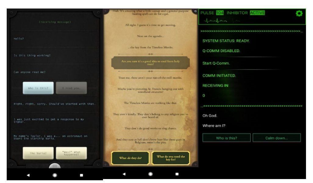
Figure 1.1: Screenshots from Lifeline, Lifeline 2, and Lifeline: Flatline